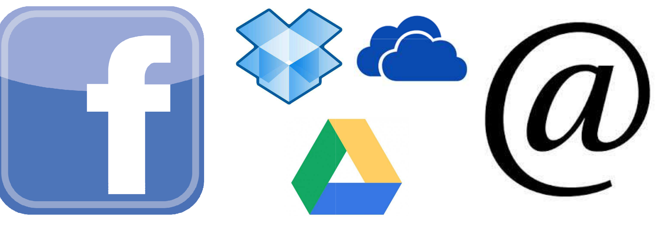
All the 20 used Facebook

Usage of multi-platforms. Most used ones?